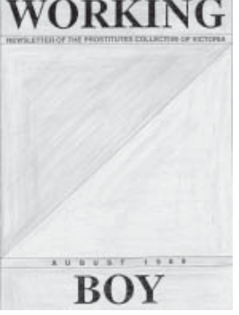
Working draft for the first publication of Working Boy

Ugly Mugs program, which enables sex workers to report clients who are violent and PCV to d is s e m i n a t e information to other sex workers is introduced at PCV in 1988 and wins